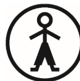
Daddy/ Father/ Dad

Here is a link to the Makaton site. https://wetalkmakaton.org/