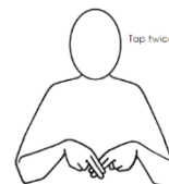
Daddy/ Father/ Dad